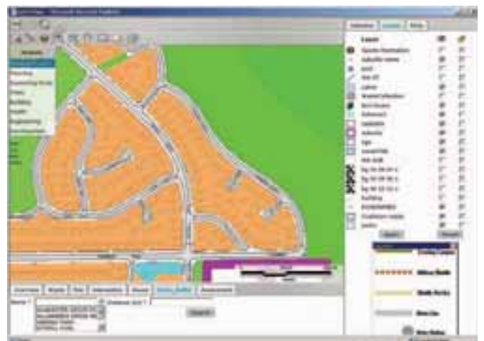
Visualise and analyse your data easily in an interactive map window