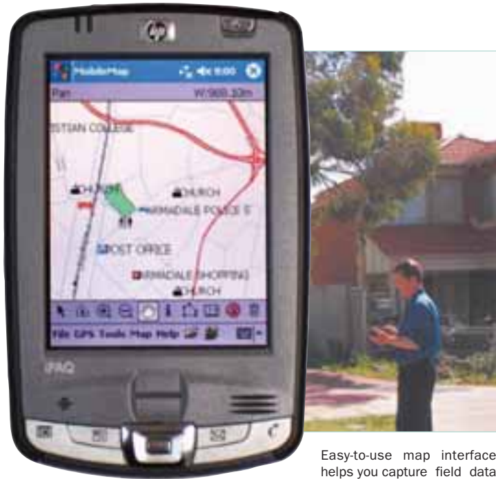
Easy-to-use map interface helps you capture field data with GPS technology