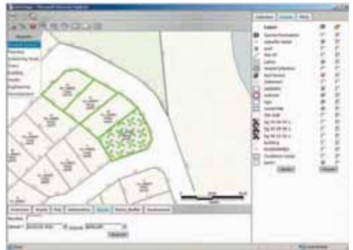
Access GIS data and data from corporate databases in a web browser