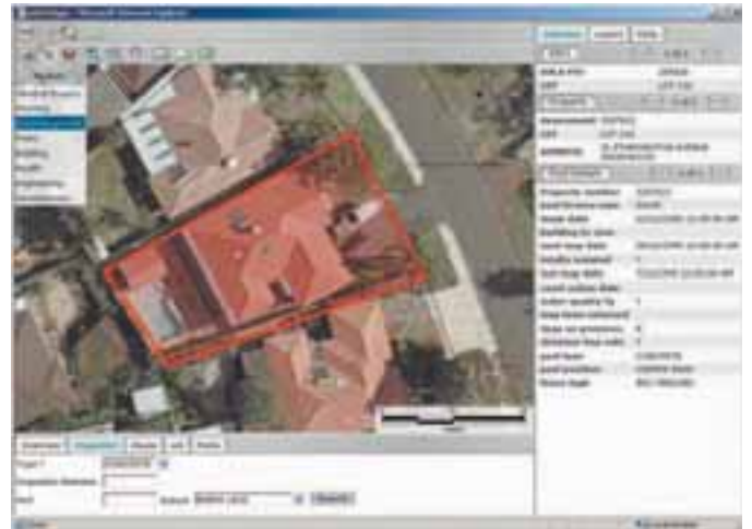
Intuitive and easy to use graphical user interface