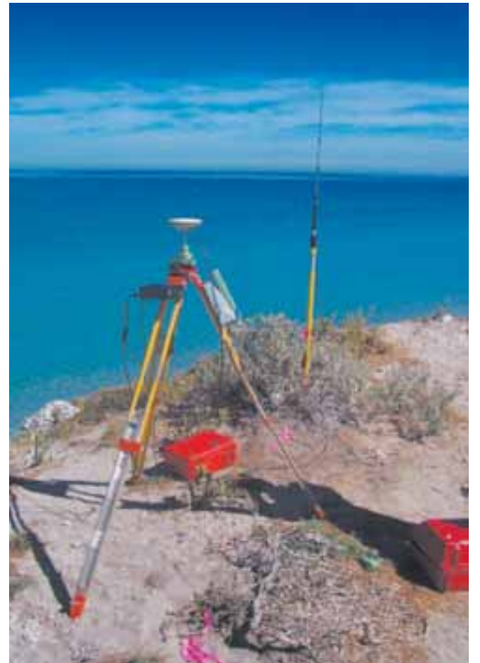
RTK beach setup