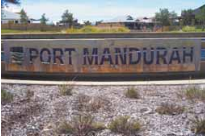
Land development canal survey