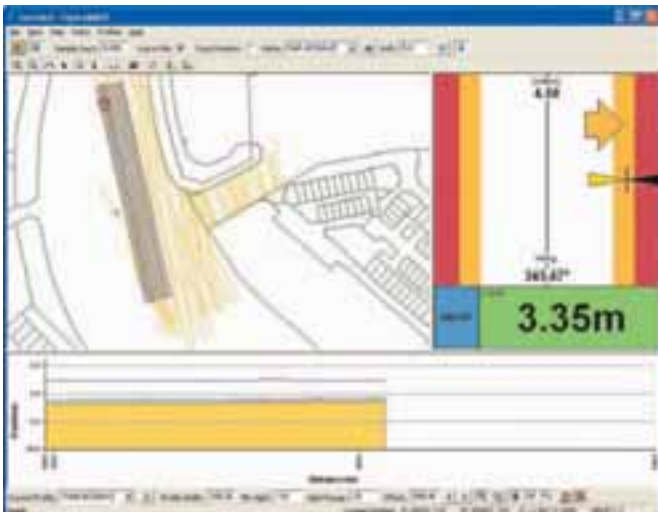
Sample display of hydrographic survey operation