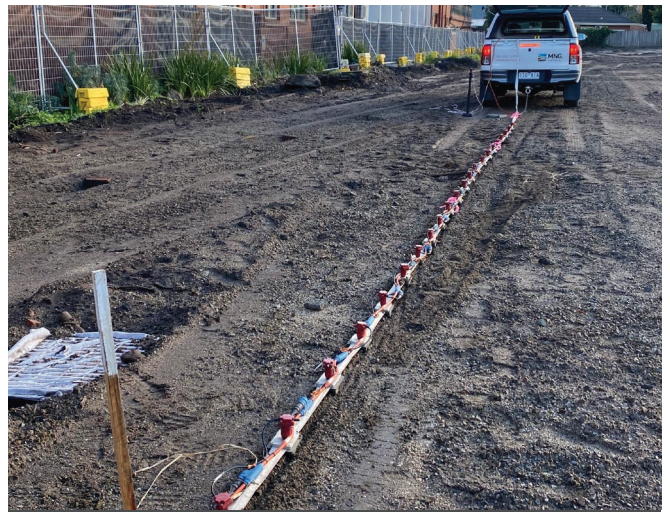
MASW ARRAY - 24 GEOPHONES (VIBRATION SENSORS)

A KEY BENEFIT TO THE CLIENT WAS THE PROVISION OF AN ACCURATE AND DETAILED REPORT ILLUSTRATING THE VOLUME AND LOCATION OF IMPORTED FILL THROUGHOUT THE SITE.