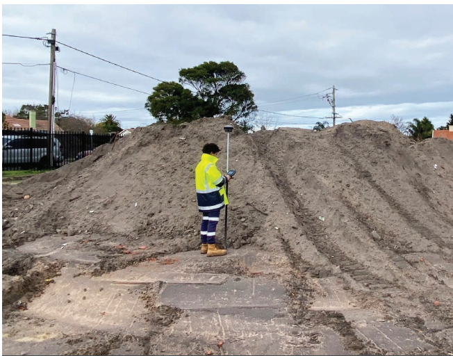
VOLUMETRIC CALCULATIONS OF ONSITE STOCKPILES

Using this information in conjunction with the topographic survey, MNG SubSpatial was able to accurately calculate the exact volume and location of imported fill throughout the site.